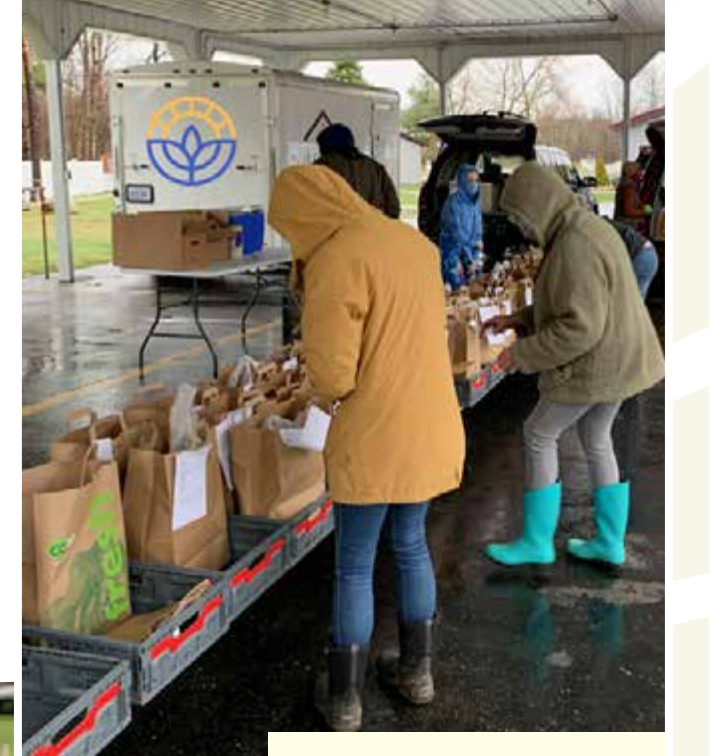
The Torch Lake Co-op adapts and grows in the face of the pandemic.

Our dollars go further when we work in a collaborative way. For example, the laws around third-party egg sales require a certifiable washing/grading facility. One of our goals is to afford such a facility, which will then allow us to sell eggs to restaurants and local grocery stores, like Grain Train Natural Foods Market or Village Market. We can achieve more when we pool our resources.