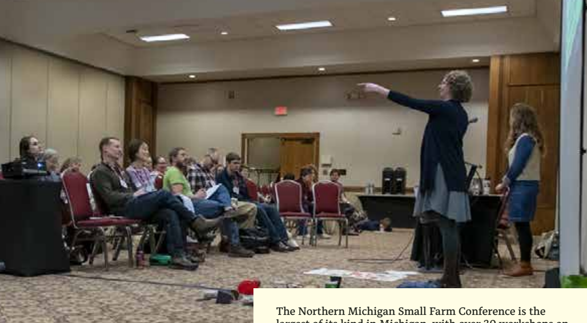
The Northern Michigan Small Farm Conference is the largest of its kind in Michigan, with over 30 workshops on growing food and the business of sustainable agriculture.